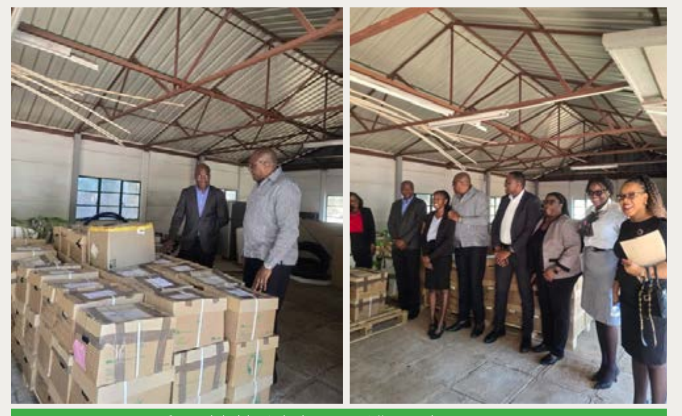
Scenes at the book donation hand-over ceremony in Harare recently