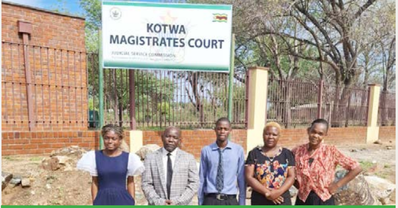
otwa Maaistrates Court Staff