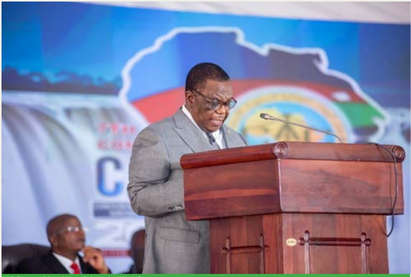
/P Chiwenaa delivers his speech during the CICA conference

The conference ran from 30 October to 3 November 2024 under the theme "Human Dignity as a Foundational Value and Principle: A Source of Constitutional Interpretation, Fundamental Human Rights Protection and Enforcement".